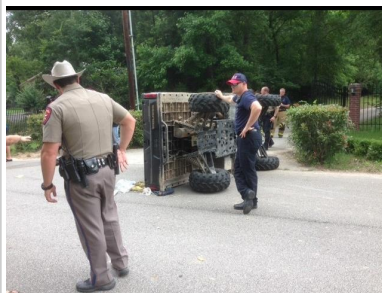
Picture of UTV that flipped on Mozelle. There were 4 children on it ages 12-14 years old.

Please be aware the Riverwalk neighborhood is seeing an influx of children driving ATV/UTV's. Texas Law states- "All Operators under the age of 14 must be accompanied by a parent or a guardian". Do not let your children drive them. The parent will be ticketed.